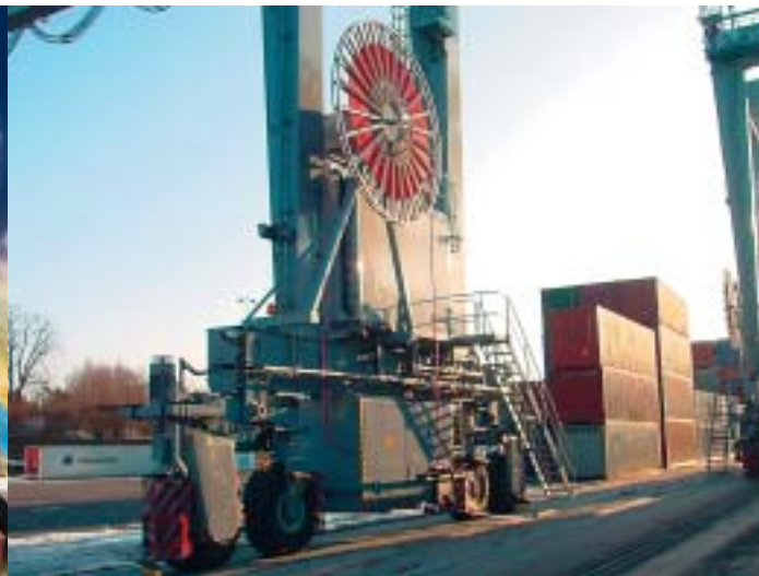
Zero [0] Emission RTG